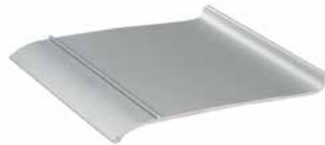
Base Module AB200