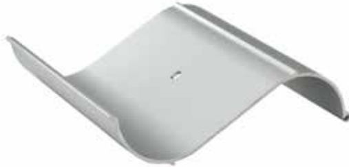
Bottle Module AS200

The wine racks are assembled from these primary components: