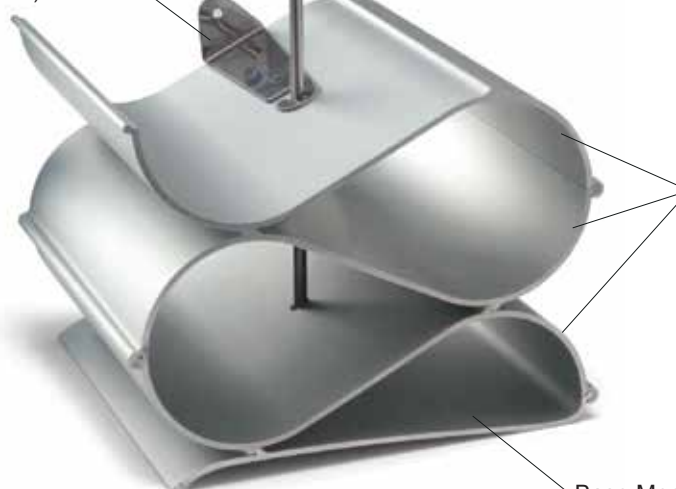
Bottle Modules AS200

Stacks must be positioned on a horizontal surface with adequate strength to support the combined weight of the rack and bottles.